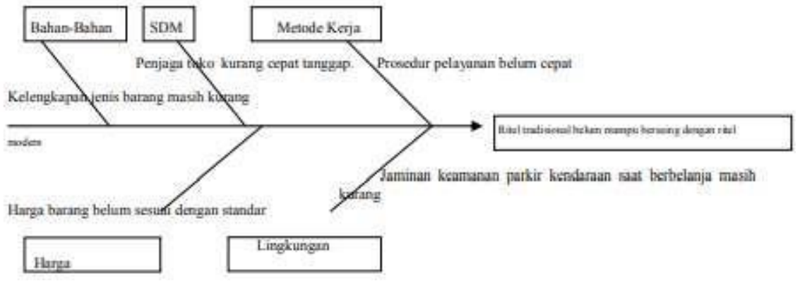
Figure 3. Fish Bond Diagram