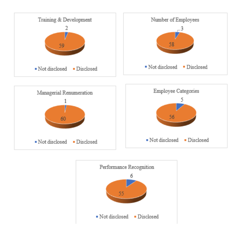
Figure 3: Pie Charts of Disclosure HRA Disclosure for Index X<sub>3</sub>, X<sub>5</sub>, X<sub>11</sub>, X<sub>12</sub>, and X<sub>14</sub>

To explore the root cause of the most indexes disclosed, the next figures show the detail numbers of the companies.